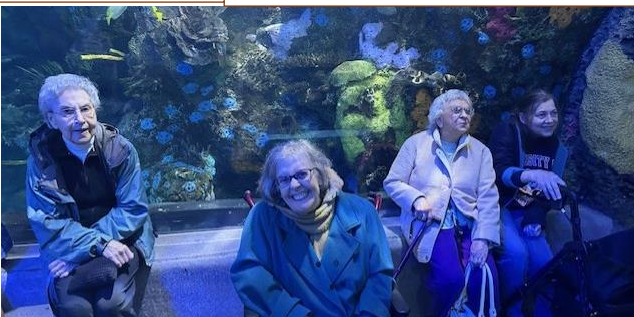
The Virginia Beach Aquarium brought smiles to our residents.