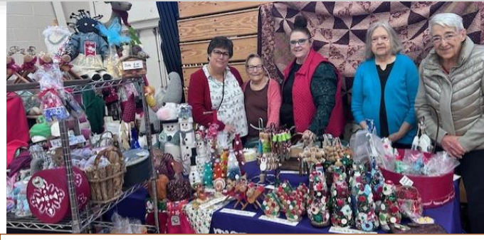
SGG Christmas Bazaar was a success!