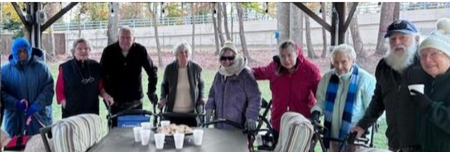
"The cold never bothered us anyway"... Especially when we have a hot cup of cocoa and smores to enjoy at our campfire.