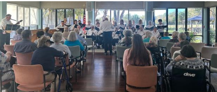
The Beach Tones performed an amazing show as always