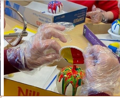
Paint pouring on mini pumpkins