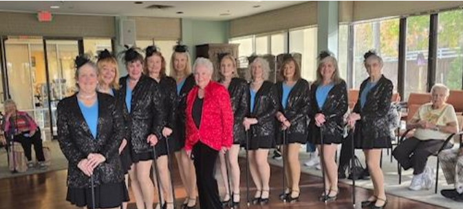
Our residents enjoyed watching the Silver Tappers